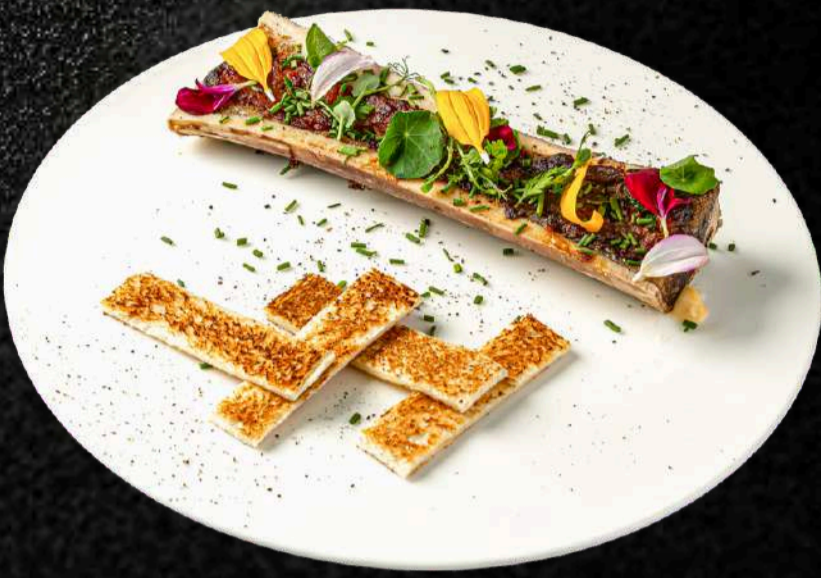
Australian Bone Marrow