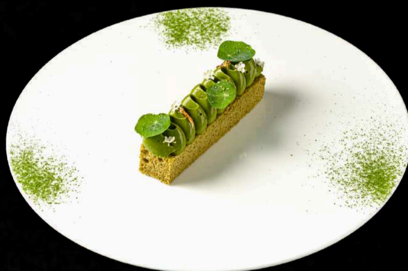
Japanese Matcha Cake

Light and Fluffy dessert with a delicate sponge layered in rich matcha silky cream and dusted with matcha powder