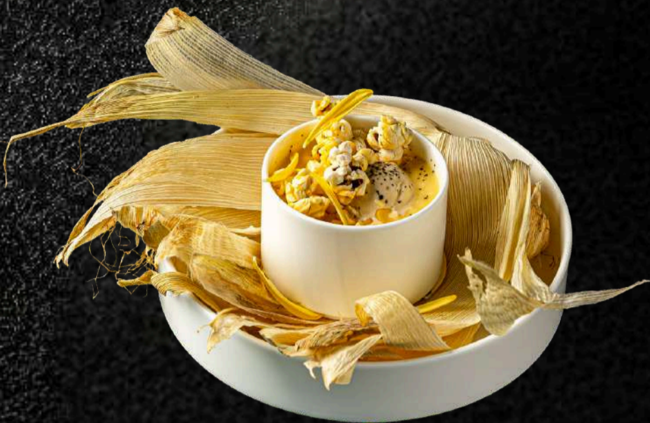
Cold Corn Soup

Sweet corn, onion, chicken bouillon, corn ice cream, popcorn.