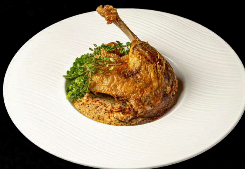
Duck Leg Confit

Rich Japanese curry with wagyu neck and onions, served over steamed rice with savory beef bouillon.