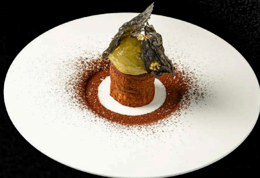
Pistachio Chocolate Lava Royale

Simple yet deeply flavorful. A molten cake made with premium Valrhona chocolate, served with rich pistachio ice cream.