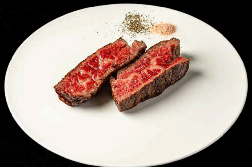
Australian Wagyu Tri Tip MB9