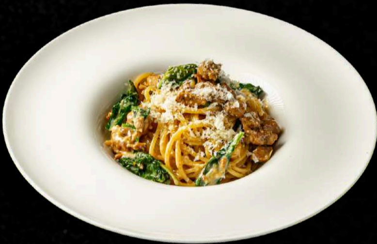
Japanese Yu-An Creamy Pasta Yu-an-marinated chicken, cream, yuzu pepper, Pecorino Romano