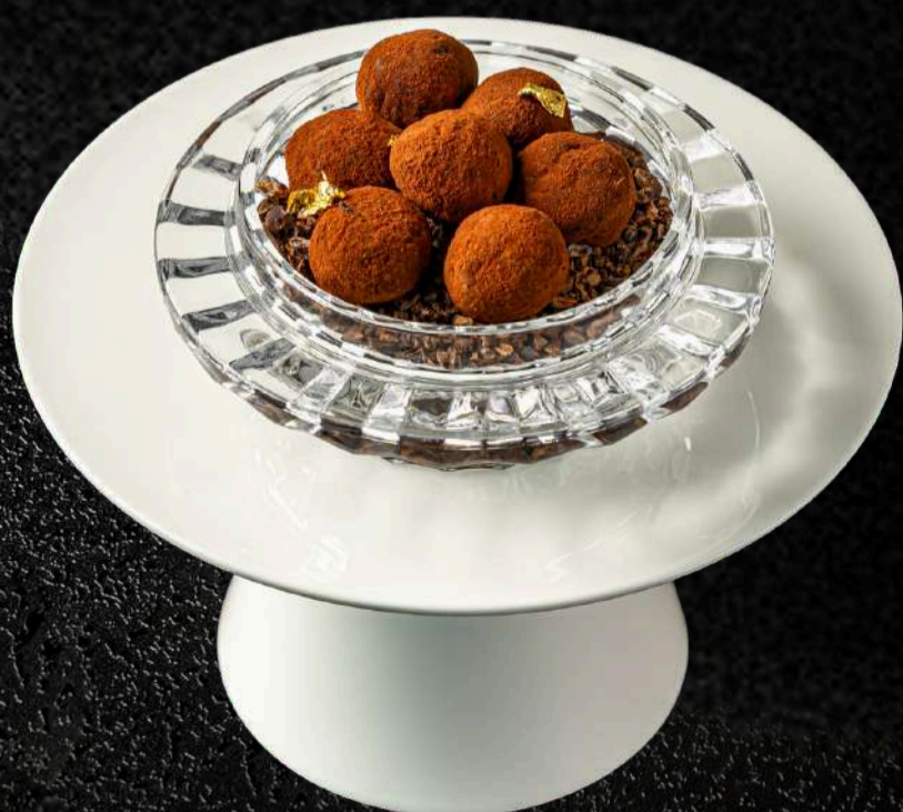
Gold Truffle Chocolate

Rich Valrhona chocolate with truffle flavor, vanilla, and salty