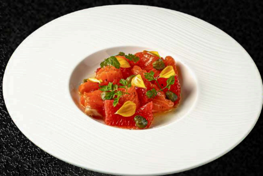
Smoked Salmon and Citrus Salad

Delicately smoked salmon served with orange, grapefruit, capers, dill, and a light citrus dressing.