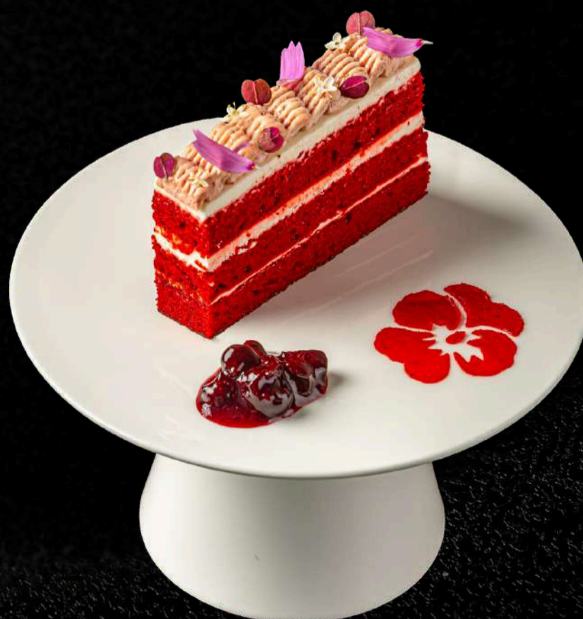
Anthem Velvet Cake

A refined take on the classic velvet cake with a Japanese chef's twist. Light raspberry buttercream with tart cassis sauce makes it easy to enjoy even after a meal.