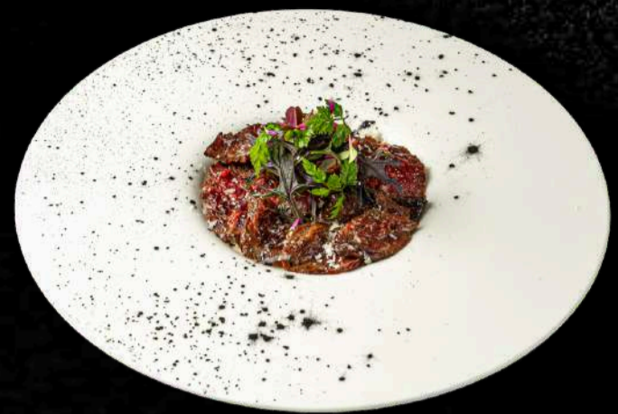
Wagyu Aburi Carpaccio