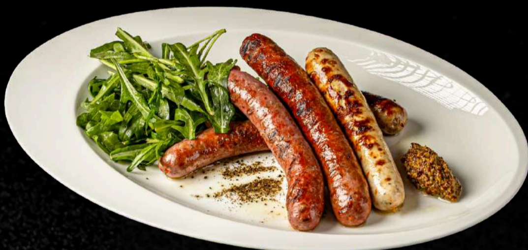
Grilled Sausage Platter

A curated selection of four gourmet sausages, served with fresh salad.