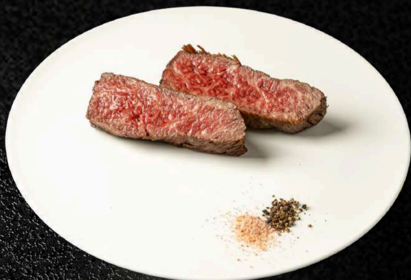
Australian Wagyu Thick Skirt MB9+