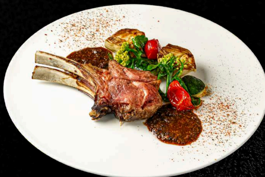
Roasted Australian Lamb Rack

Roasted pork belly with herb paste and Italian prosciutto, salad, walnut sauce