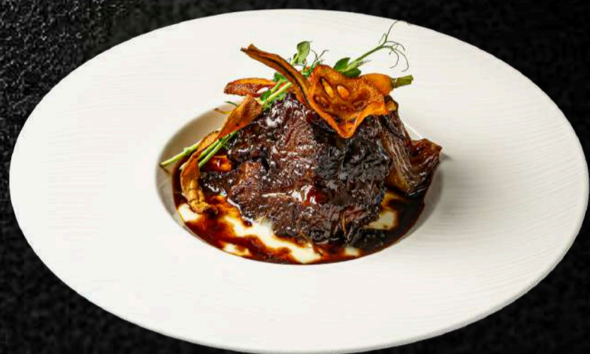
Braised Wagyu Beef Cheek