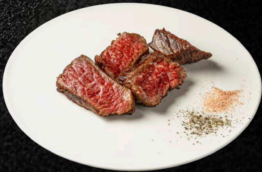
Japanese Wagyu A5 Picanha