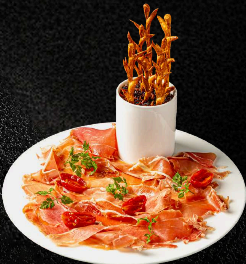
Italian prosciutto platter

Prosciutto slices, semi-dried tomatoes, arugula, Pecorino Romano, grissini