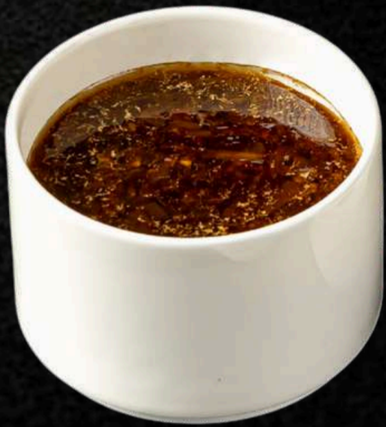
Japanese Onion Steak Sauce