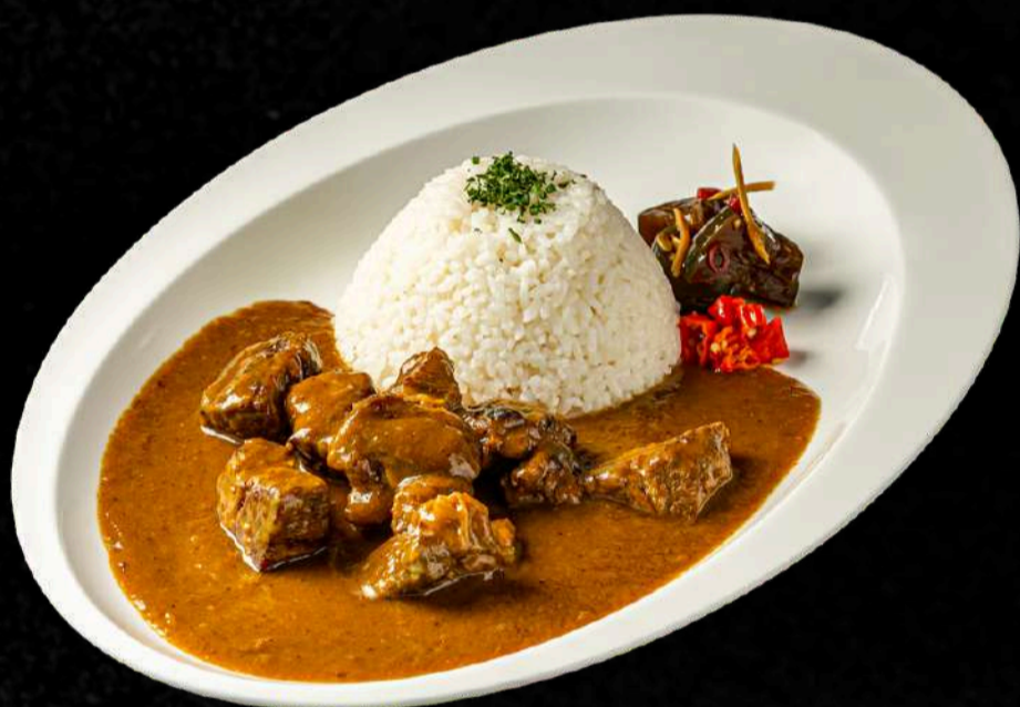
Wagyu Beef Curry

Wagyu beef patty, Dijon mayo, original sauce, mozzarella, salad, French fries