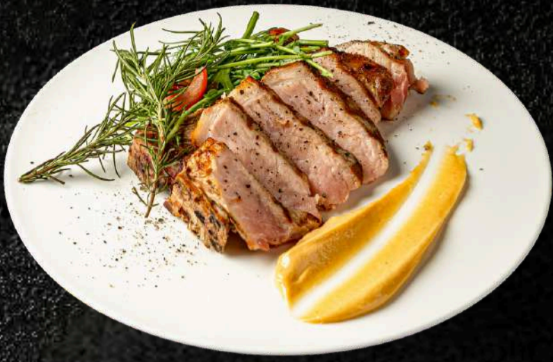
Grilled Pork Chop Marinated in Koji Bone-in pork chop marinated in Japanese koji