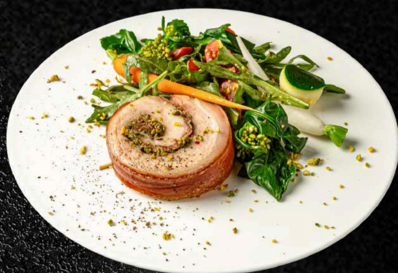
Pork Belly Porchetta

Aroma oil, roasted vegetables with mustard sauce.