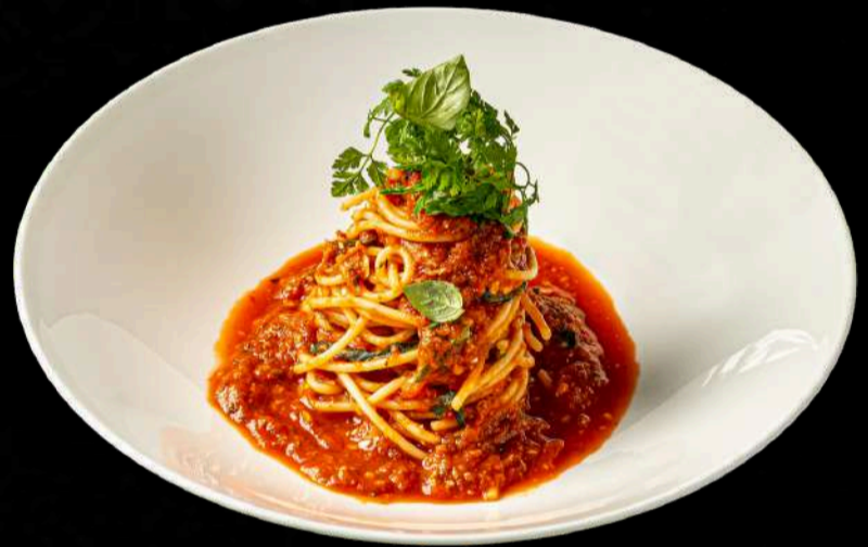
Spaghetti alla Puttanesca