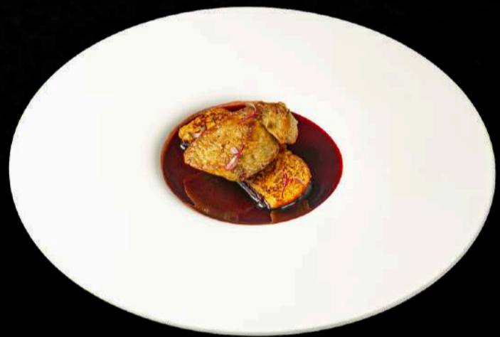
Pan-Seared Foie Gras