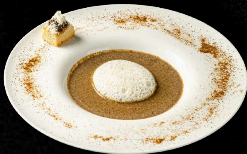
Creamy Porcini Mushroom Soup

Mushrooms and porcini in chicken bouillon, cream, croutons, truffle foam.