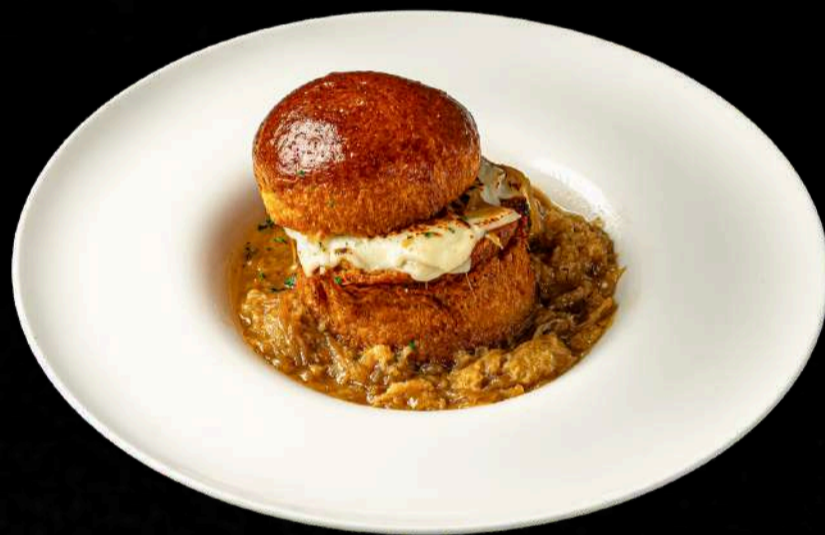
Onion Gratin Soup

Brioche case, caramelized onion, Gruyère cheese, beef bouillon.