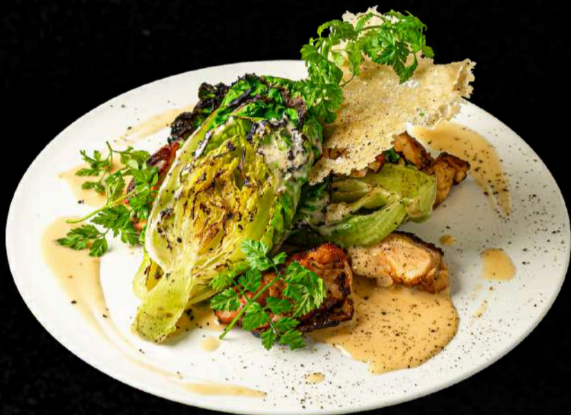
Grilled Chicken and Grilled Baby Romain Cesar Salad

Mexican-marinated chicken, special Caesar dressing, Parmesan cheese tuile, black pepper.