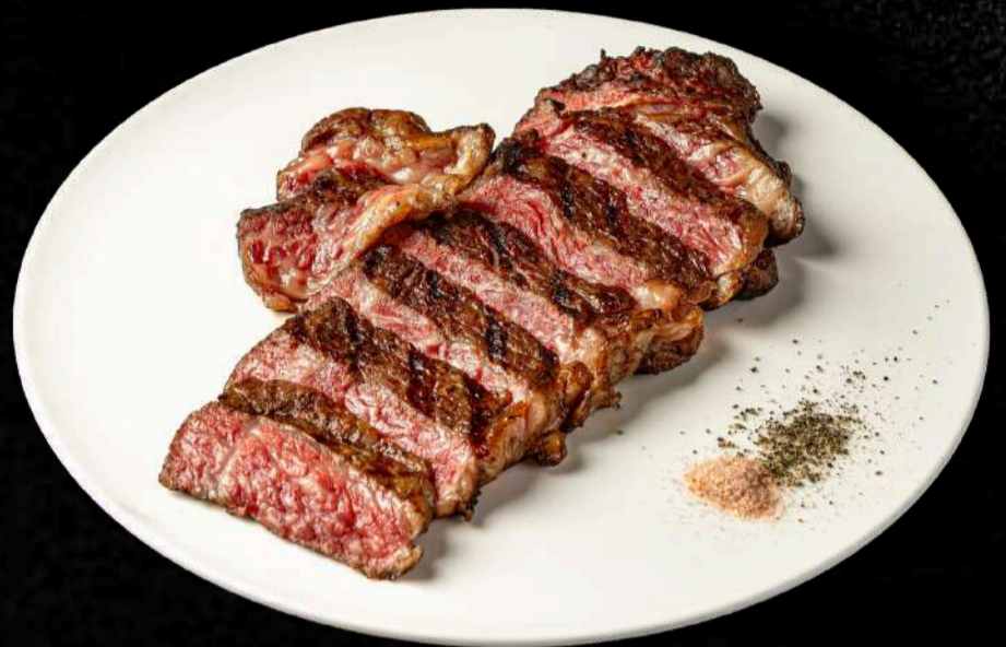
Australian Wagyu Striploin MB 8/9