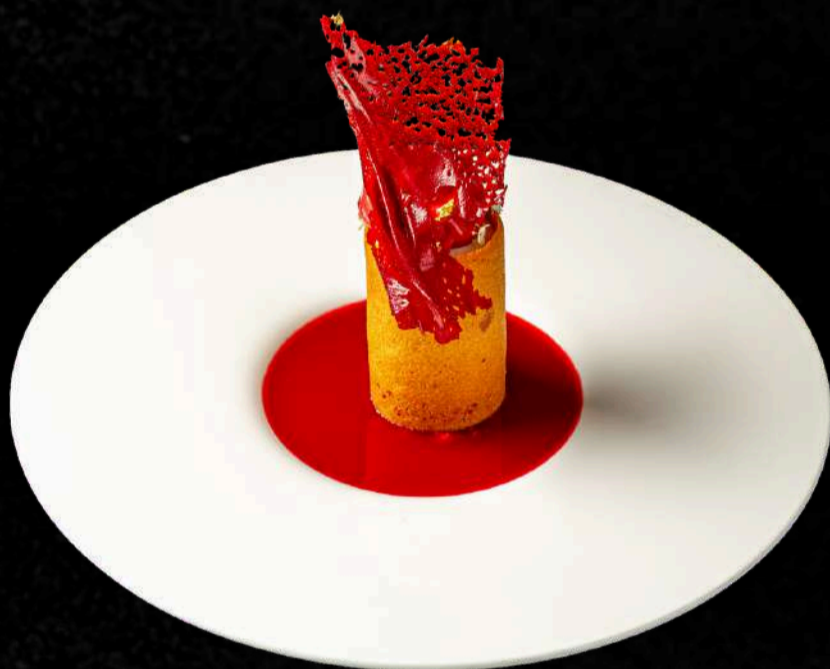
Strawberry Crystal d'Opaline

Strawberry sorbet with crème Danjean, fresh strawberry slices Joconde biscuit, and framboise sauce.