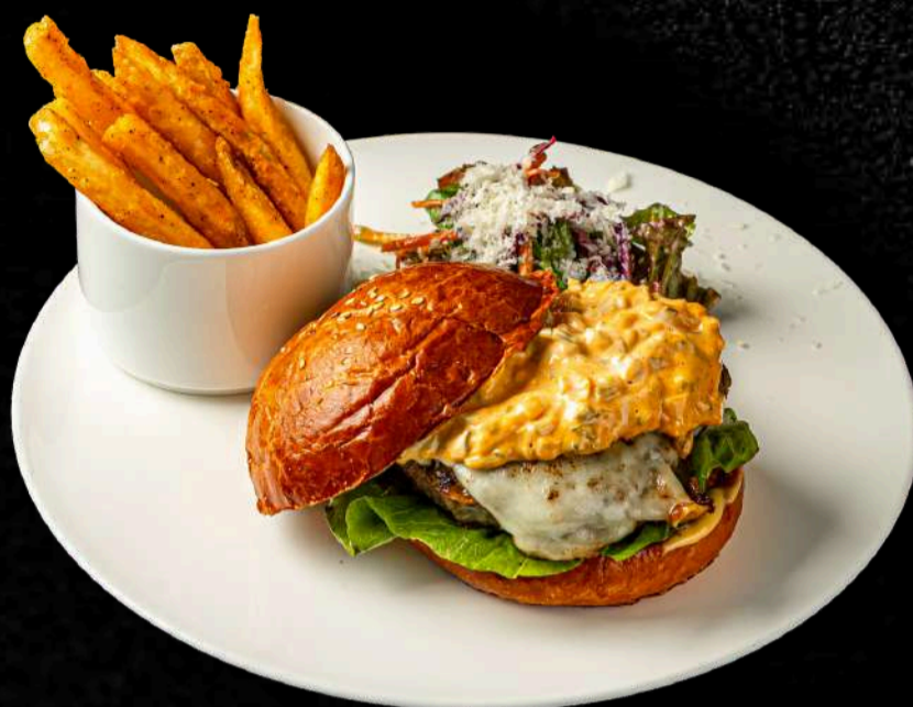
Wagyu Beef Burger

Red wine, mirepoix, baby carrot, dauphinoise gratin, roasted onion