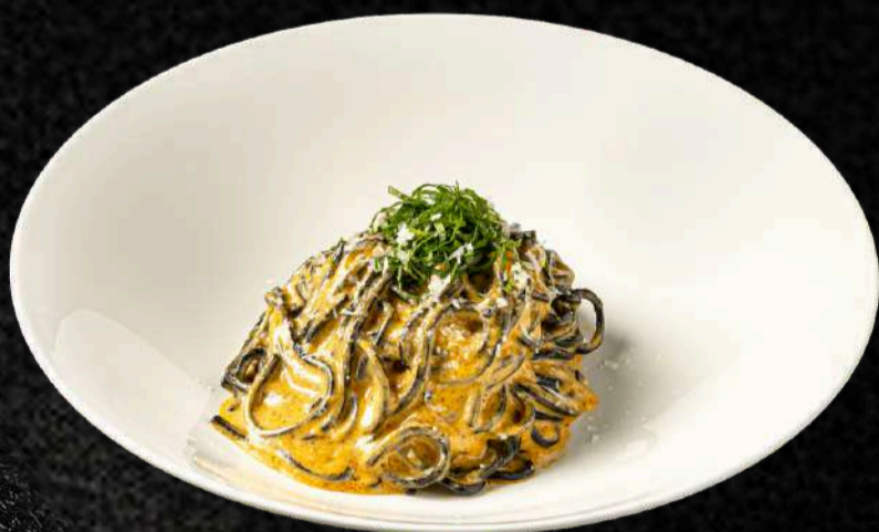
Uni Cream Pasta Sea urchin paste, Japanese broth, eggs, cream, soy sauce, oba leaf

Arrabbiata sauce, olives, capers, anchovies, basil