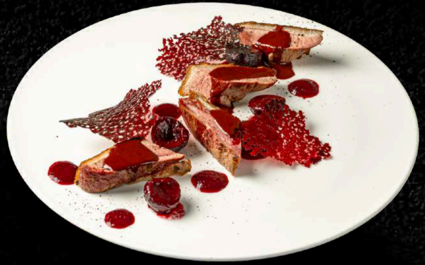
Roasted Duck Breast