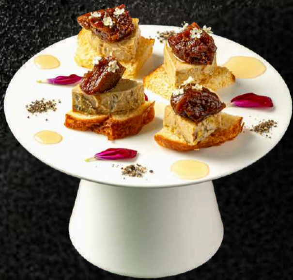
Foie Gras Canappe Foie gras pâté, fig compote, brioche